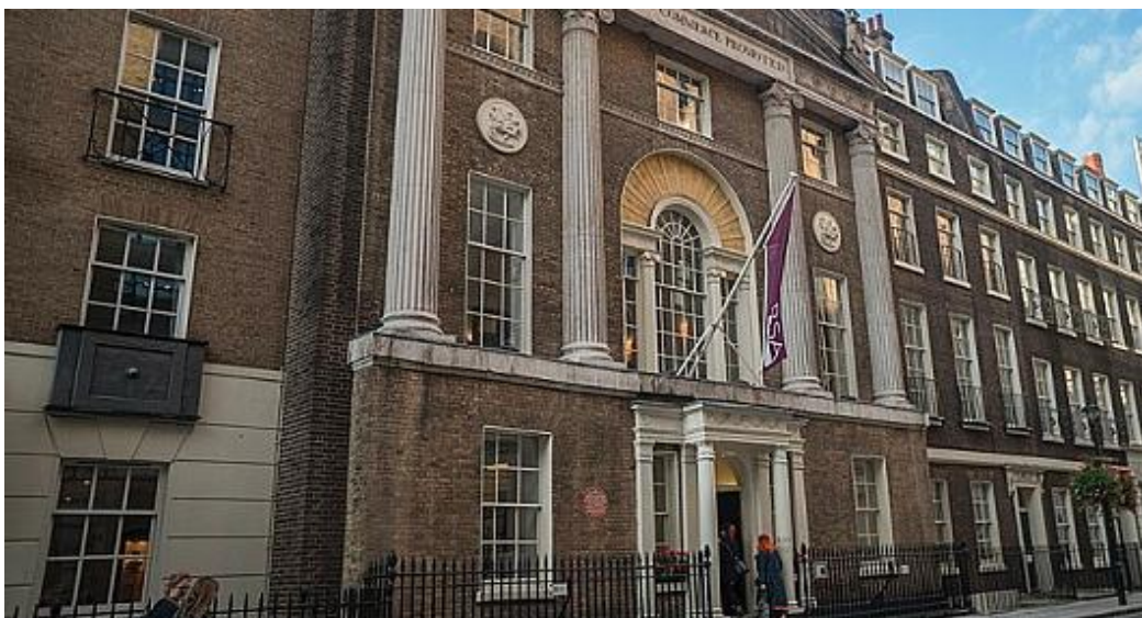
Royal Society of Arts House, 8 John Adam Street, London, United Kingdom

For more details contact the Administration Office at admin@stclements.edu