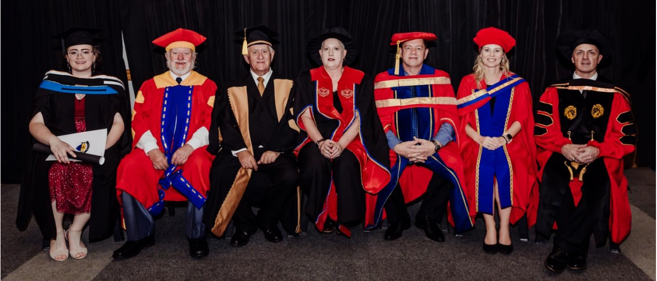
Academic Council Members

A graduation ceremony was held on Saturday, 7 th December 2024, at Utopia Place, Equestria, Pretoria, South Africa. It was a celebratory event, culminating in academic achievement, filled with learning, growth, and a transition to new opportunities. Students, Families, and friends came together to acknowledge the students' hard work and dedication.